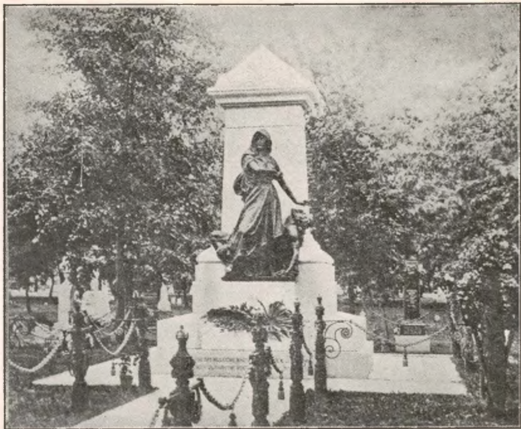
Chicago Anarchist Memorial, Waldheim Cemetery, Chicago.